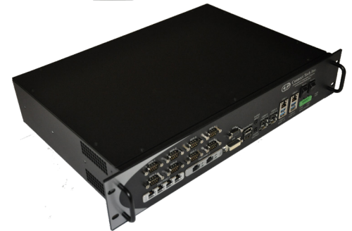
Product Name: COM Express® Type 6 PMC/XMC Carrier Part Number: CCG007