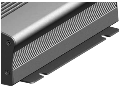
Surface Edge Mount